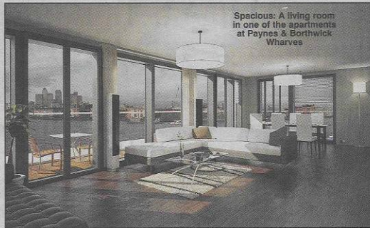
Spacious: A living room in one of the apartments at Paynes & Borthwick Wharves

product we're offering is of the highest quality, which is reflected in both the sales success it's received already and in our decision to press ahead with an official launch to stay ahead of the game. So long as the product and location are