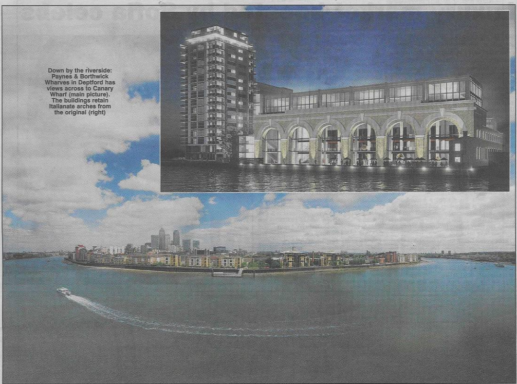
Down by the riverside: Paynes & Borthwick Wharves in Deptford has views across to Canary Wharf (main picture). The buildings retain Italianate arches from the original (right)