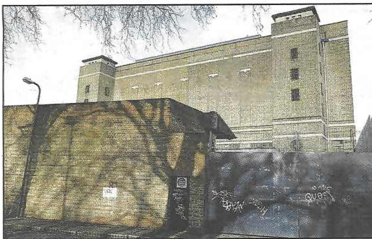
Work to demolish Borthwick Wharf has already begun

Site will provide 'stunning' new destination